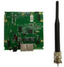
WiFi module with antenna